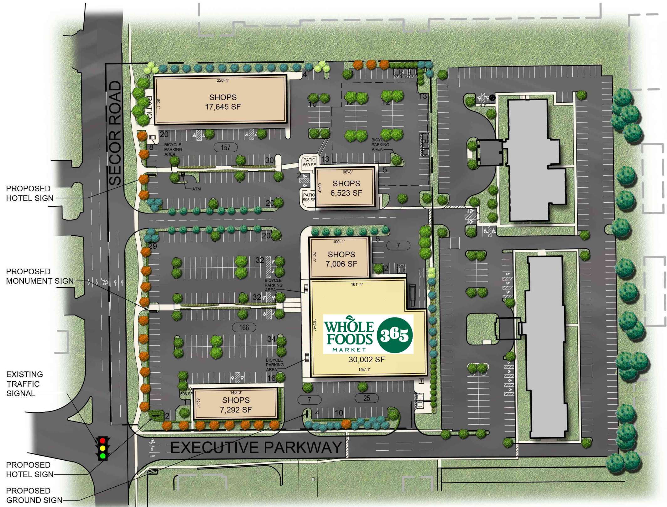
1 SITE PLAN SP.08 SCALE: 1" = 100'